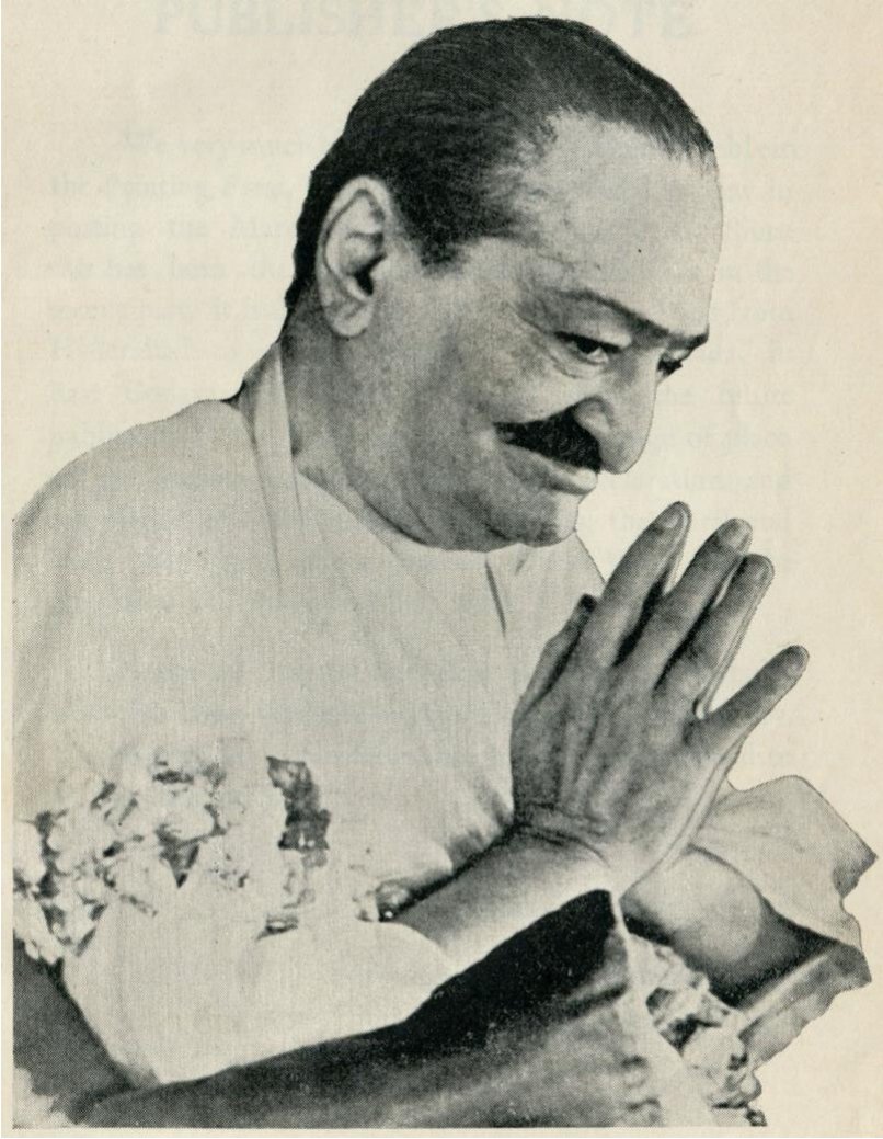
AVATAR MEHER BABA