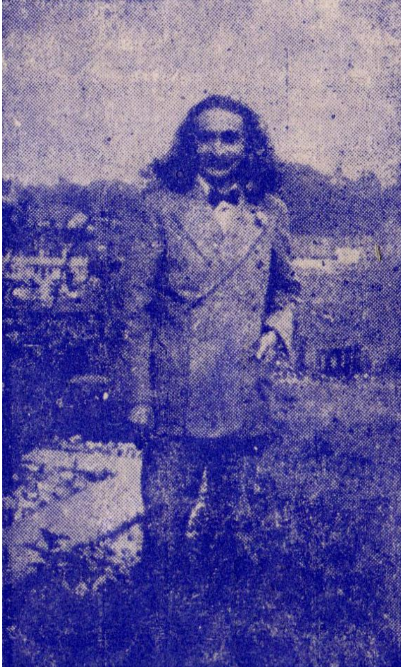
AVATAR MEHER BABA