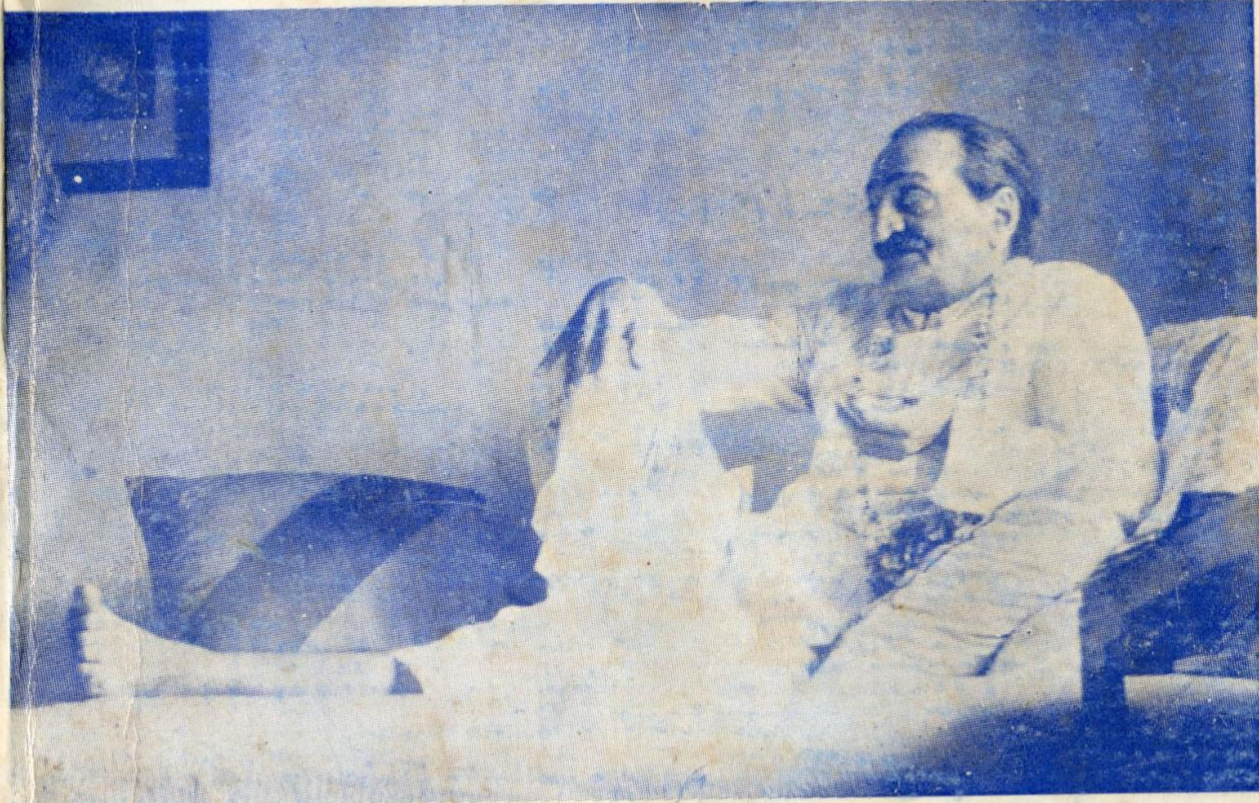
AVATAR MEHER BABA

PUBLISHERS: THE MEHER VIHAR TRUST HYDERABAD-29. - A. P. - INDIA.