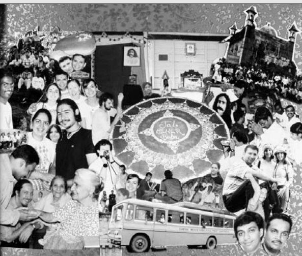
Collage of Young Adult Sahavas happenings.